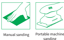
Manual sanding Portable machine sanding